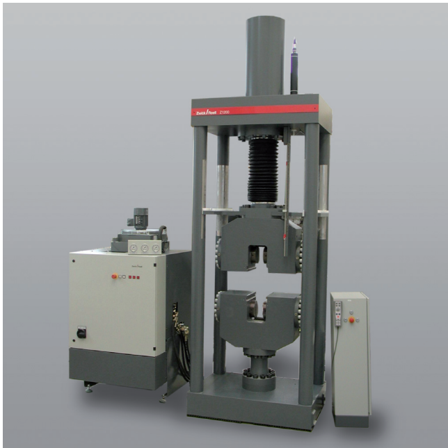
Figure: Zwick Z1200H with hydraulic grips