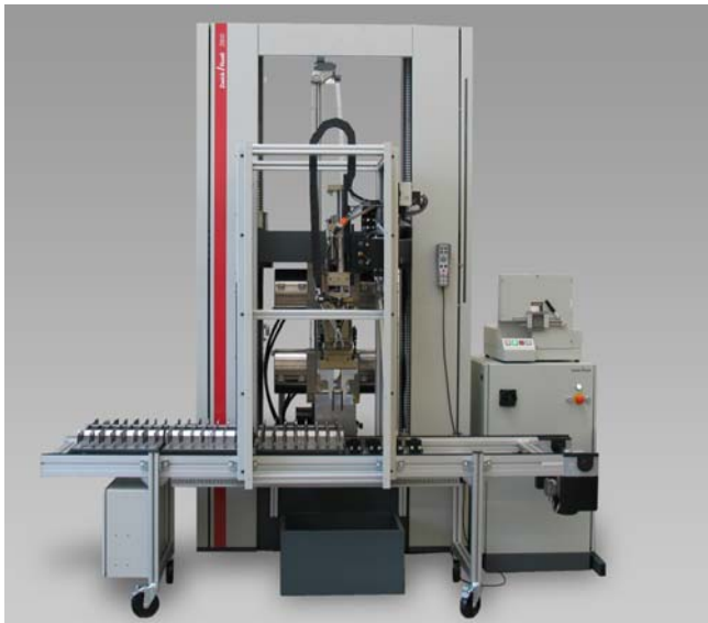
Robotic testing system 'roboTest C' with testing machine 600 kN