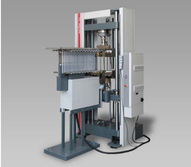
Robotic Testing System 'roboTest F'