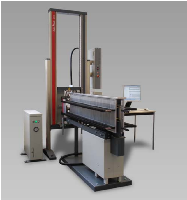
Robotic Testing System 'roboTest F'