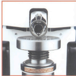
Measuring of the inner contact surface of a bearing's outer ring with 23 mm diameter