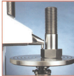
Measuring of the contact surface of a high-strength screw