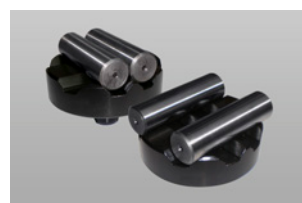
Support tables for round specimens