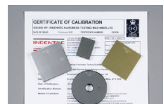
Hardness comparison plate with certificate