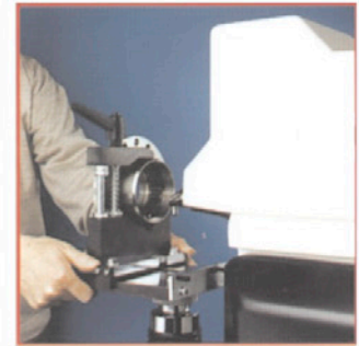
Preparation to measure inside of a gear box part