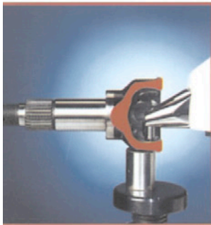
Measuring of the inner contact surface of a cardan shaft driver

Indenter fixturing enables hardness tests on measuring locations that are difficult to access to: