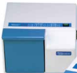
Stomacher® 80 Biomaster