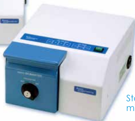
Stomacher® 80 microBiomaster