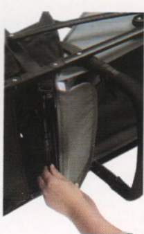
2. Pull out the pull handle below the seat, footrest can be lengthened.