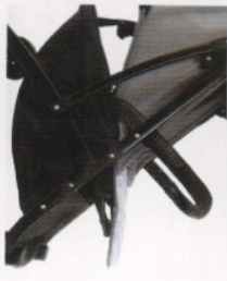
3. Footrest in full lying position.