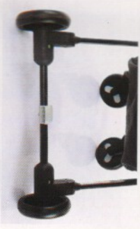
5. Brake is unlocked when step the button forward and holes shown green.