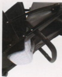
1. Footrest in sitting position.