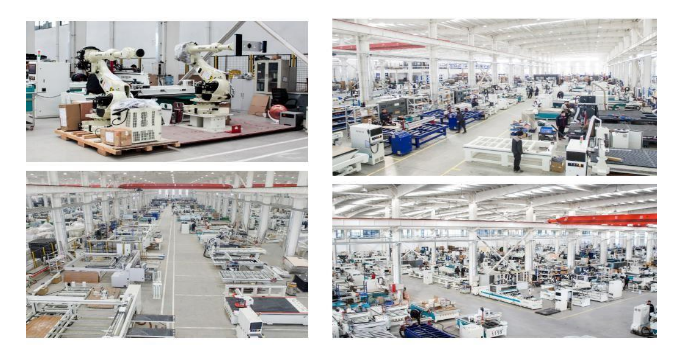
In-house Machining Center Facility