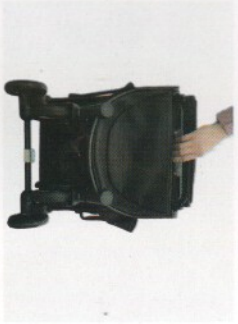
1. Pull out the large pull handle.