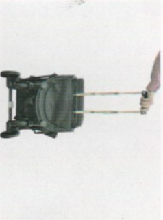
2. Lift the small pull handle.