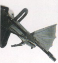
4. Backrest in sitting position.