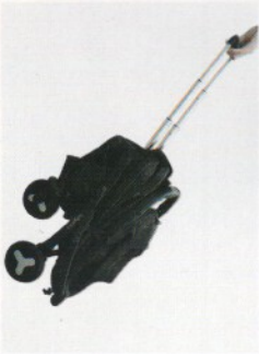
3. Easy to take after folding.