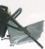
2. Backrest in full lying position.