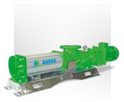
HELIX DRIVE Eccentric screw pump