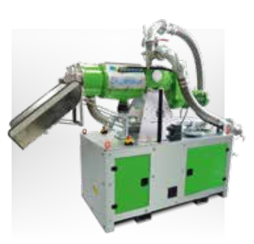
SEPARATOR PLUG & PLAY System for portable slurry separation