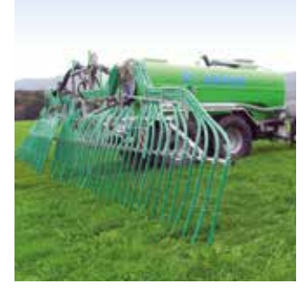
Trailing hose applicator Modular system for all types of tankers