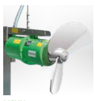
MSXH Submersible motor mixer