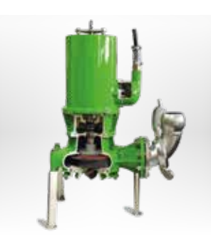
MAGNUM CSPH Submersible motor pump gear unit design