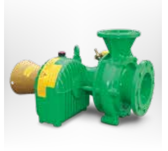
MAGNUM SM Thick matter pump gear unit design