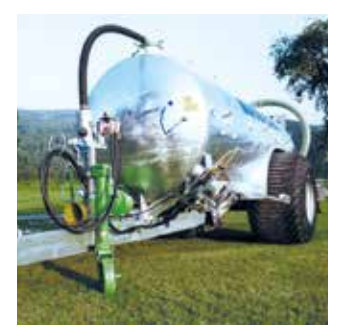
Slurry tankers and polyester tanker Different tanker types for every requirement