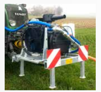
Screw compressor Three-point attachment

The compressor blows air through the hoses to empty them at a pressure of 15 bar and a rate of 7,700 or 12,000 liters/minute.