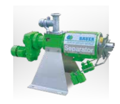
SEPARATOR Press screw separator for solid-liquid separation