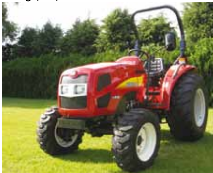
SHIBAURA EUROPE BV