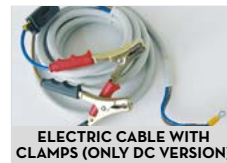
ELECTRIC CABLE WITH CLAMPS (ONLY DC VERSION)