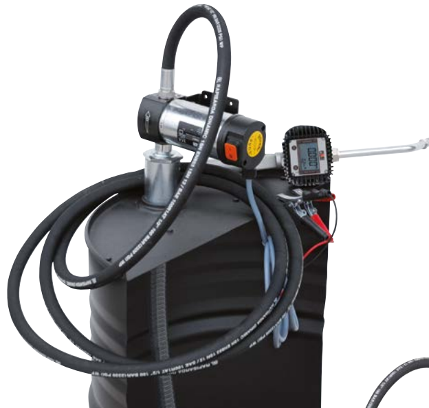
VISCOMAT GEAR DRUM DC