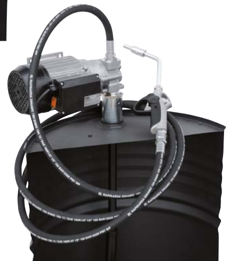
VISCOMAT GEAR DRUM AC