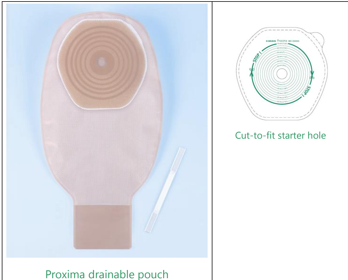
Proxima drainable pouch